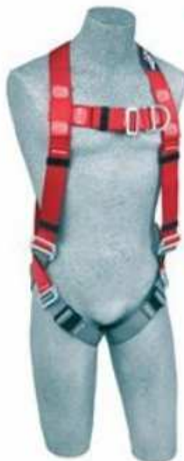
AB113 HARNESS Front & back 'D'