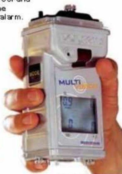
MULTIVISION Tried and tested waterproof gas detection.