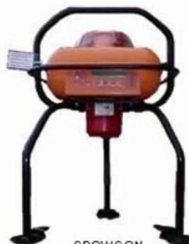
CROWCON DETECTIVE Multi personnel monitor.