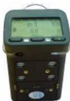
GFG 450 has a unique ATEX torch.