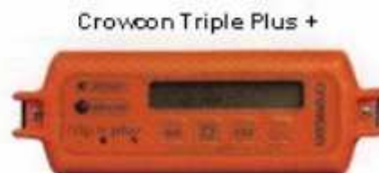
Crowcon Triple Plus +

ALL PERSONNEL USING EQUIPMENT FOR CONFINED SPACE ENTRY MUST HOLD A CURRENT CERTIFICATE.