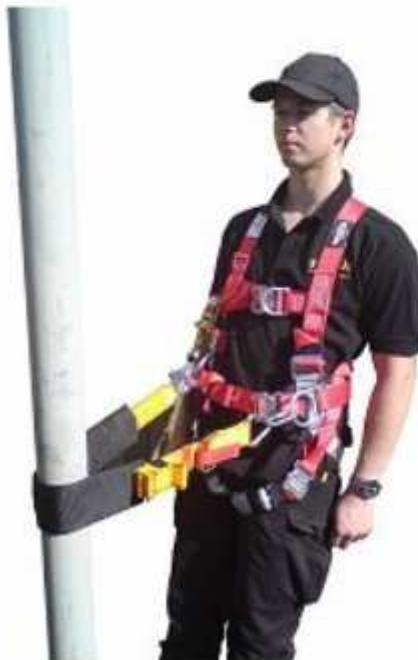
Protecta AB214335 Work Positioning Harness