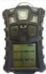
MSA ALTAIR 4 Waterproof and with lone worker alarm.