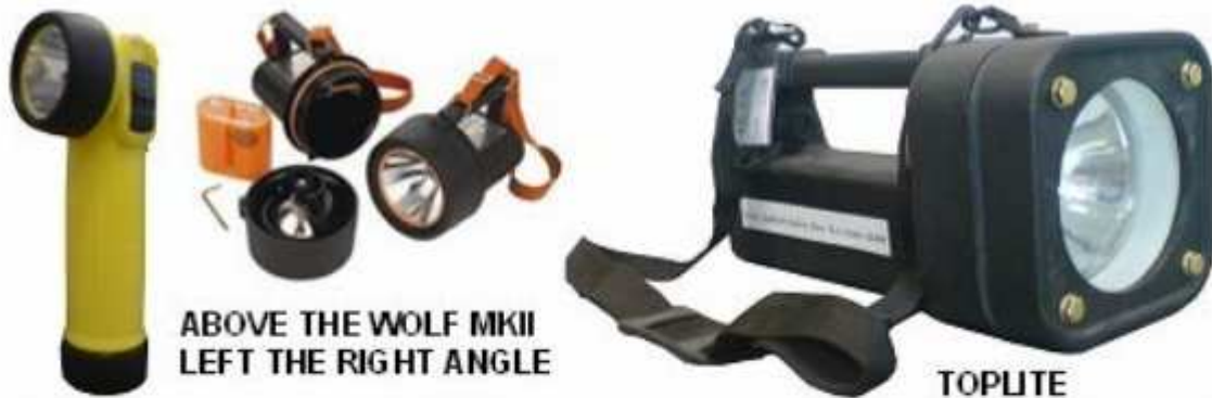
ABOVE THE WOLF MKII LEFT THE RIGHT ANGLE

We offer a range of Wolf hand held ATEX rated torches, from the handy 2 cell right angle , Wolf MKII hand held rechargeable and the shoulder carried Toplite, where a high intensity beam is required. All offer full ATEX protection, and right angle torches have a clip mount so that they can be fixed to a harness etc so as to leave both hands free. We have whatever solution you need for ATEX lighting.